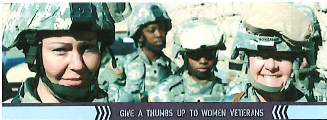
GIVE A THUMBS UP TO WOMEN VETERANS